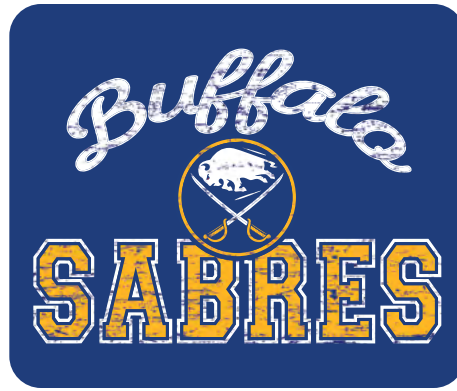
CC62 SCREEN PRINT