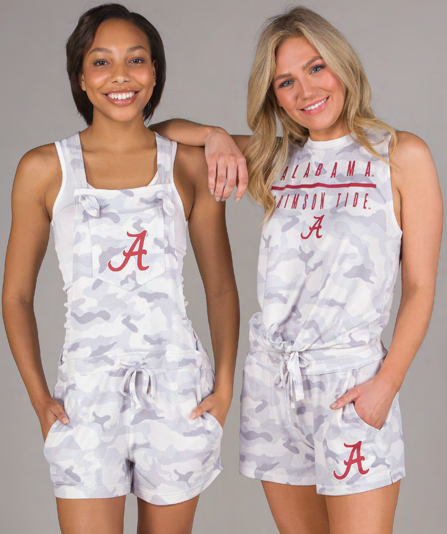
QGG – Overall 94% polyester/6% spandex printed hacci with center pocket screen print. Available in gray camo. S-XL (By size)