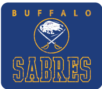
LB05 SCREEN PRINT