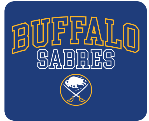
CC66 SCREEN PRINT