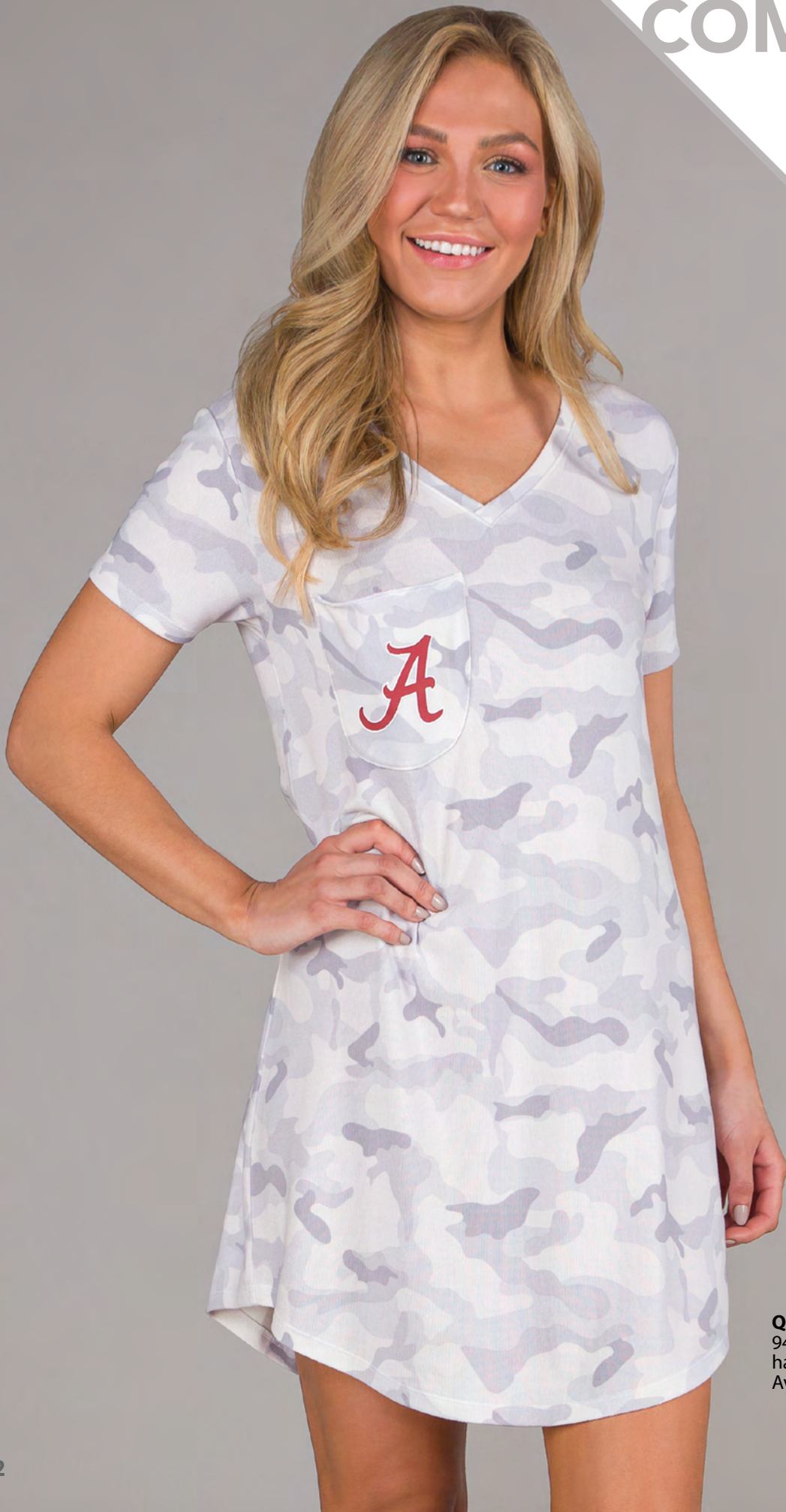
QGD - Nightshirt 94% polyester/6% spandex printed hacci with right pocket screen print. Available in gray camo. S-XL (By size)