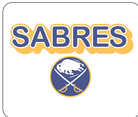
SS09 SPOT SUBLIMATION