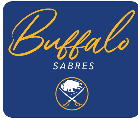
CC65 SCREEN PRINT