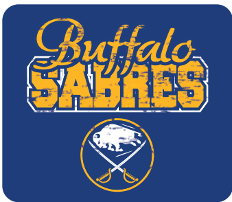
LB01 SCREEN PRINT