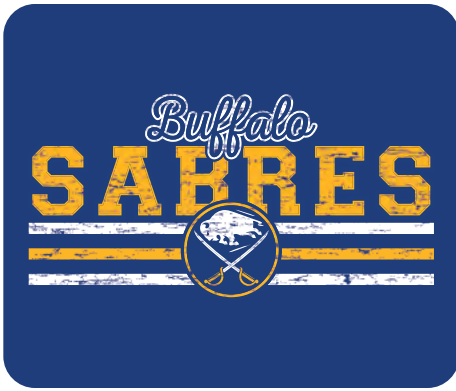
CC61 SCREEN PRINT