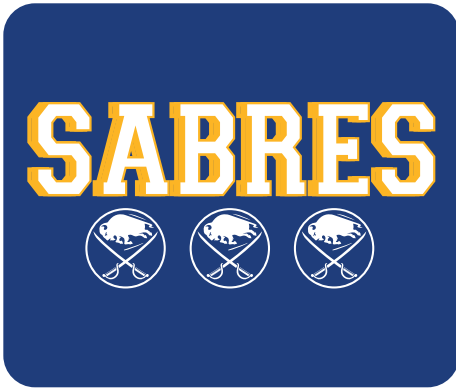
CC67 SCREEN PRINT