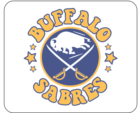
SS07 SPOT SUBLIMATION