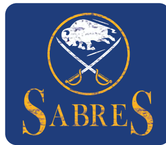
LB03 SCREEN PRINT