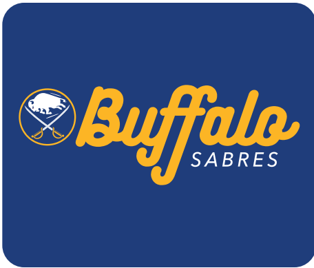
CC64 SCREEN PRINT