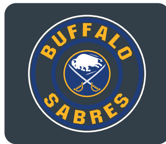
LB02 SCREEN PRINT