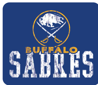
LB06 SCREEN PRINT